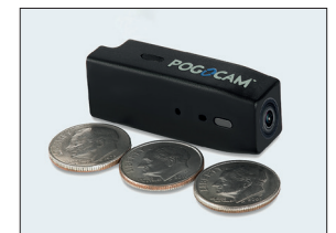
The world's smallest eyewear-mountable camera