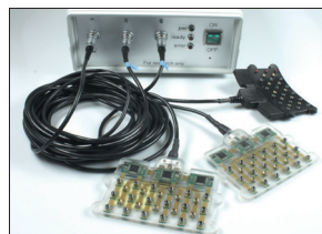
Spatially resolved brain oxygen supply measurement