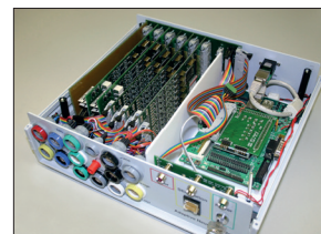
Neuro stimulator for deep brain stimulation