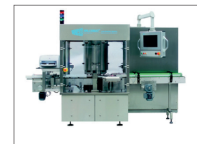
In-line quality control for pharmaceutical industry